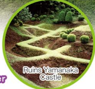
Ruins Yamanaka Castle